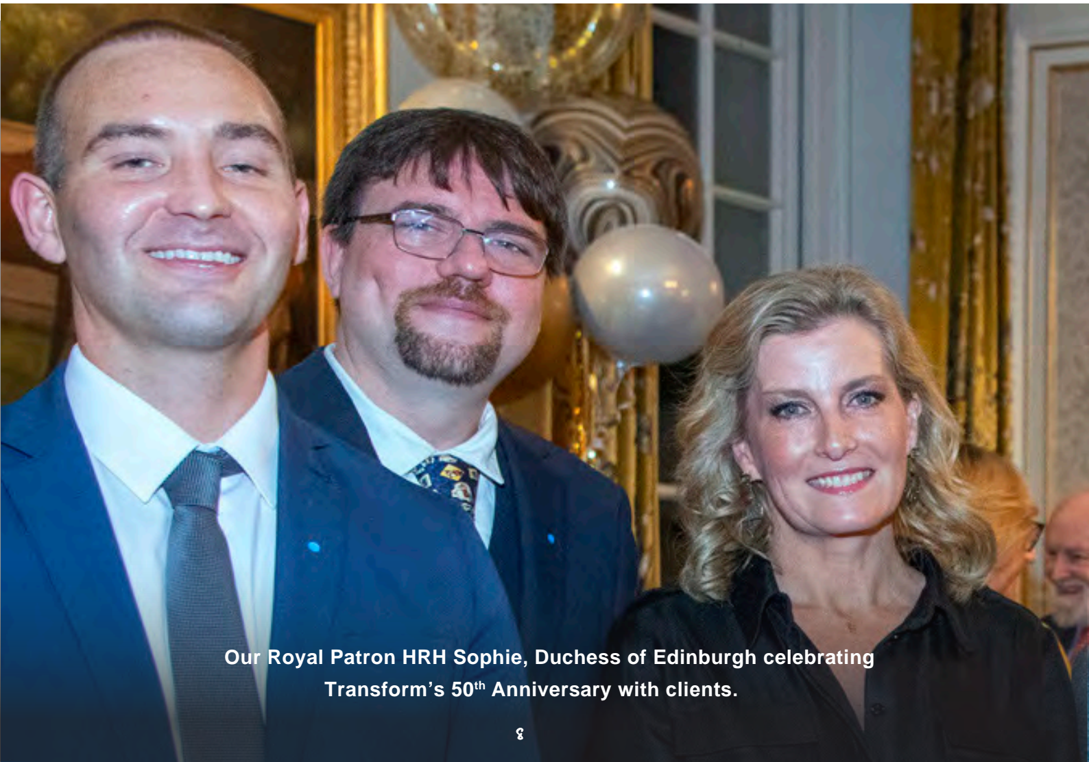
Our Royal Patron HRH Sophie, Duchess of Edinburgh celebrating Transform's 50 th Anniversary with clients.