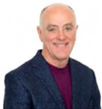
Eddie Gray OBE