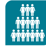
Enabling residents and communities