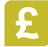
Providing financial sustainability