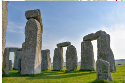
STONEHENGE SALISBURY SP4 7DE