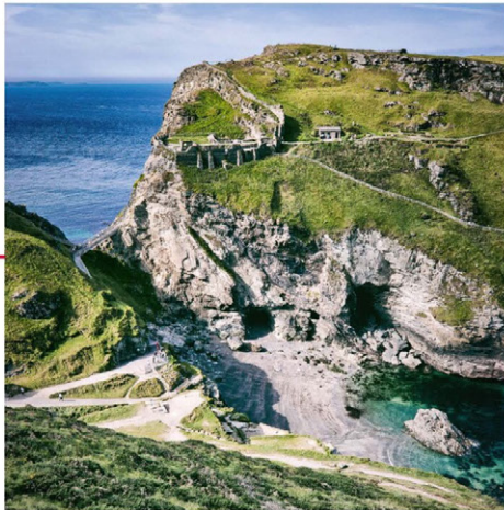
TINTAGEL CASTLE Cornwall PL34 0HE