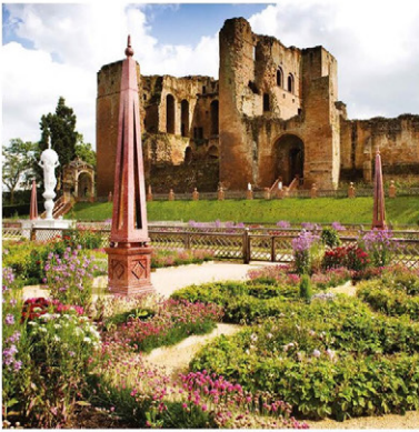
KENILWORTH CASTLE AND ELIZABETHAN GARDEN Warwickshire CV8 1NG