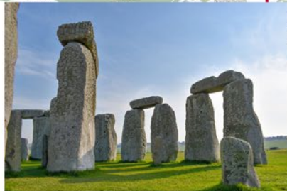
STONEHENGE SALISBURY SP4 7DE