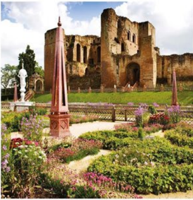
KENILWORTH CASTLE AND ELIZABETHAN GARDEN Warwickshire CV8 1NG