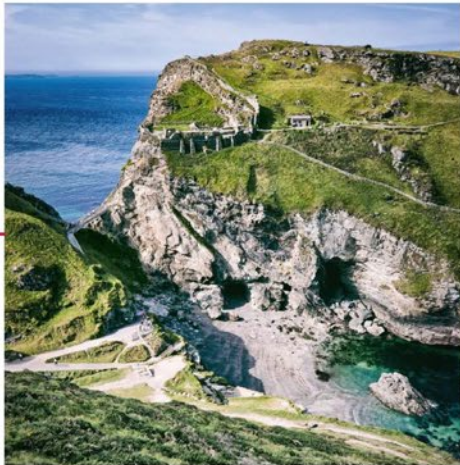
TINTAGEL CASTLE Cornwall PL34 0HE